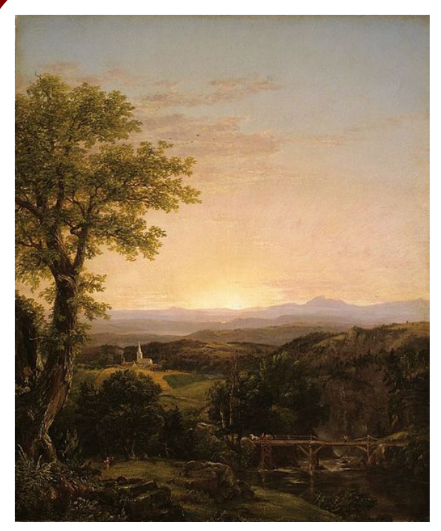
New England Scenery (1839)