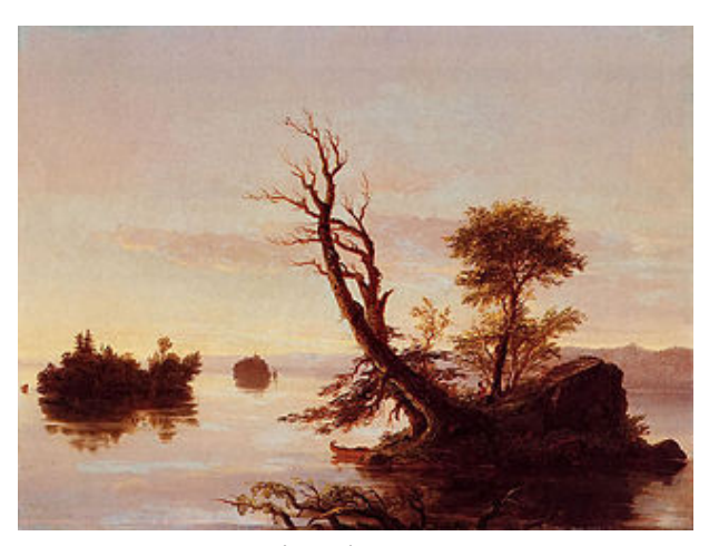
American Lake Scene (1844)

In this great element of scenery, what land is so rich? I would not speak of the Great Lakes, which are in fact inland seas--possessing some of the attributes of the ocean, though destitute of its sublimity; but of those smaller lakes, such as Lake George, Champlain, Winnipisiogee, Otsego, Seneca, and a hundred others, that stud like gems the bosom of this country.