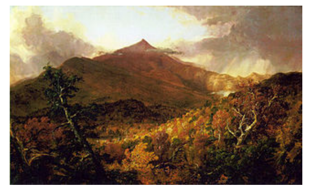
Schroon Mountain Adirondacks (1838)

As mountains are the most conspicuous objects in landscape, they will take the precedence in what I may say on the elements of American scenery.