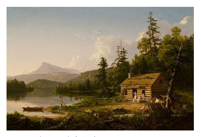
Home in the Woods (1847)

has its legend, worthy of poet's pen or the painter's pencil. But American associations are not so much of the past as of the present and the future. Seated on a pleasant knoll, look down into the bosom of that secluded valley, begin with wooded hills--through those enamelled meadows and wide waving fields of grain, a silver stream winds lingeringly along--here, seeking the green shade of trees--there, glancing in the sunshine: on its banks are rural dwellings shaded by elms and garlanded by flowers--from yonder dark mass of foliage the village spire beams like a star. You see no ruined tower to tell of outrage--no gorgeous temple to speak of ostentation; but freedom's offspring-peace, security, and happiness, dwell there, the spirits of the scene.