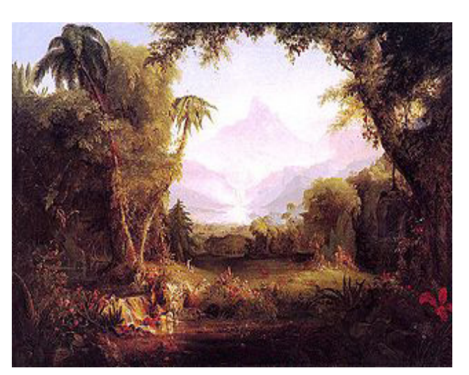
The Garden of Eden (1828)

May we at times turn from the ordinary pursuits of life to the pure enjoyment of rural nature; which is in the soul like a fountain of cool waters to the way-worn traveller; and let us Learn The laws by which the Eternal doth sublime And sanctify his works, that we may see The hidden glory veiled from vulgar eyes.