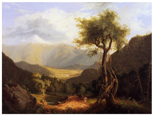
View in the White Mountains (1827)

It is true that in the eastern part of this continent there are no mountains that vie in altitude with the snow-crowned Alps--that the Alleghanies and the Catskills are in no point higher than five thousand feet; but this is no inconsiderable height; Snowdon in Wales, and Ben-Nevis in Scotland, are not more lofty; and in New Hampshire, which has been called the Switzerland of the United States, the White Mountains almost pierce the region of perpetual snow. The Alleghanies are in general heavy in form; but the Catskills, although not broken into abrupt angles like the most picturesque mountains of Italy, have varied, undulating, and exceedingly beautiful outlines--they heave from the valley of the Hudson like the subsiding billows of the ocean after a storm.