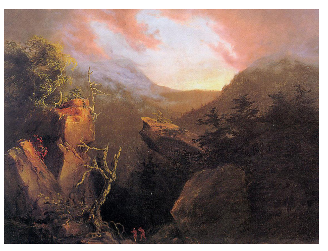
Mountain Sunrise, Catskill (1826)

Did our limits permit I would endeavor more fully to show how necessary to the complete appreciation of the Fine Arts is the study of scenery, and how conducive to our happiness and well-being is that study and those arts; but I must now proceed to the proposed subject of this essay--American Scenery!