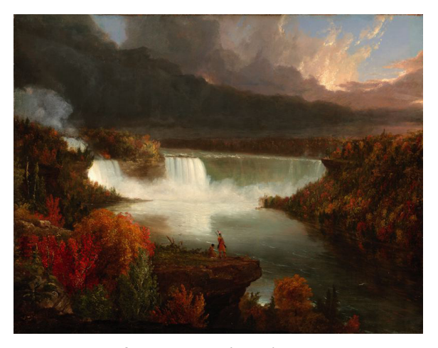
Distant View of Niagra Falls (1830)

In the Kaaterskill we have a stream, diminutive indeed, but throwing itself headlong over a fearful precipice into a deep gorge of the densely wooded mountains--and possessing a singular feature in the vast arched cave that extends beneath and behind the cataract. At Trenton there is a chain of waterfalls of remarkable beauty, where the foaming waters, shadowed by steep cliffs, break over rocks of architectural formation, and tangled and picturesque trees mantle abrupt precipices, which it would be easy to imagine crumbling and "time disporting towers."