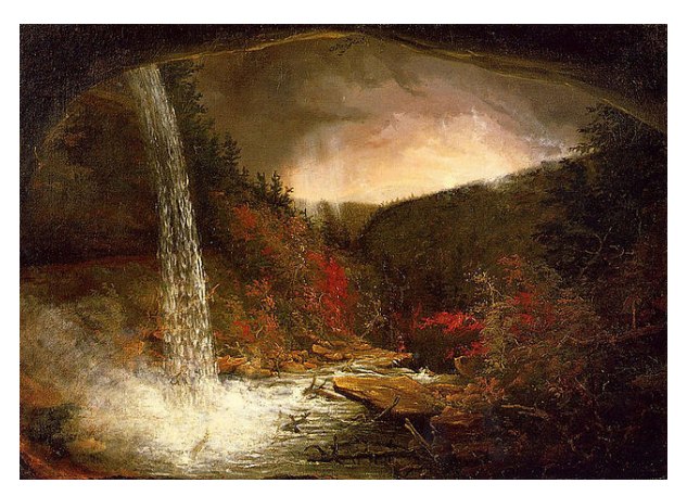
Kaaterskill Falls (1826)

The waterfall may be called the voice of the landscape, for, unlike the rocks and woods which utter sounds as the passive instruments played on by the elements, the waterfall strikes its own chords, and rocks and mountains reecho in rich unison. And this is a land abounding in cataracts; in these Northern States where shall we turn and not find them? Have we not Kaaterskill, Trenton, the Flume, the Genesee, stupendous Niagara, and a hundred others named and nameless ones, whose exceeding beauty must be acknowledged when the hand of taste shall point them out?