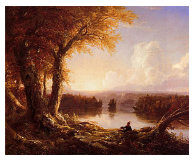
Indian at Sunset (1845-47)

lovely at sunrise, and so splendid at sunset. In the one it breathes over the earth the crystallike ether, in the other liquid gold.