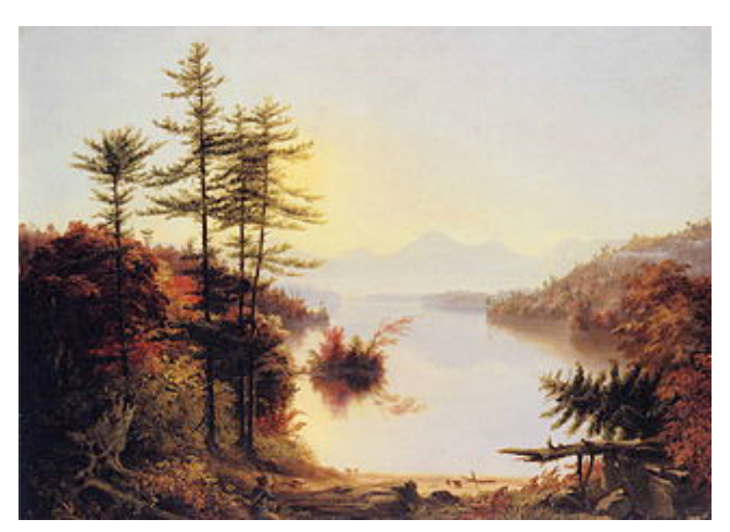
View on Lake Winnipiseogee (1828)

There is one delightful quality in nearly all these lakes--the purity and transparency of the water. In speaking of scenery it might seem unnecessary to mention this; but independent of the pleasure that we all have in beholding pure water, it is a circumstance which contributes greatly to the beauty of landscape; for the reflections of surrounding objects, trees, mountains, sky, are most perfect in the clearest water; and the most perfect is the most beautiful.