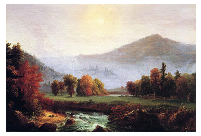
Morning Mist Rising Plymouth New Hampshire (1830)

precipitous Highlands; whose dark foundations have been rent to make a passage for the deep-flowing river? And, ascending still, where can be found scenes more enchanting?