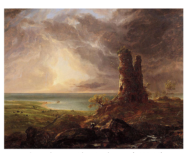
Romantic Landscape with Ruined Tower (1832-36)

And, although an enlightened and increasing people have broken in upon the solitude, and with activity and power wrought changes that seem magical, yet the most distinctive, and perhaps the most impressive, characteristic of American scenery is its wildness.