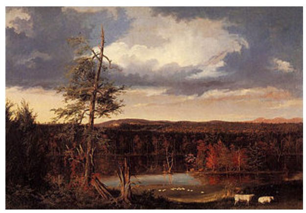
Landscape, the Seat of Mr. Featherstonhaugh in the Distance (1826)

There is one season when the American forest surpasses all the world in gorgeousness--that is the autumnal;--then every hill and dale is riant in the luxury of color--every hue is there, from the liveliest green to deepest purple from the most golden yellow to the intensest crimson. The artist looks despairingly upon the glowing landscape, and in the old world his truest imitations of the American forest, at this season, are called falsely bright, and scenes in Fairy Land.