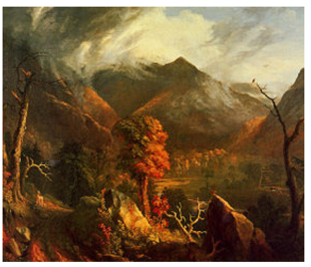
Peace at Sunset (Evening in the White Mountains) (1827)

These are circumstances productive of great variety and picturesqueness--green umbrageous masses--lofty and scathed trunks--contorted branches thrust athwart the sky--the mouldering dead below, shrouded in moss of every hue and texture, from richer combinations than can be found in the trimmed and planted grove. It is true that the thinned and cultivated wood offers less obstruction to the feet, and the trees throw out their branches more horizontally, and are consequently more umbrageous when taken singly; but the true lover of the picturesque is seldom fatigued--and trees that grow widely apart are often heavy in form, and resemble each other too much for picturesqueness.