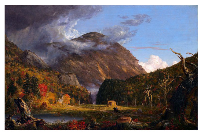
Crawford Notch (1839)

Poetry and Painting sublime and purify thought, by grasping the past, the present, and the future--they give the mind a foretaste of its immortality, and thus prepare it for performing an exalted part amid the realities of life. And rural nature is full of the same quickening spirit--it is, in fact, the exhaustless mine from which the poet and the painter have brought such wondrous treasures--an unfailing fountain of intellectual enjoyment, where all may drink, and be awakened to a deeper feeling of the works of genius, and a keener perception of the beauty of our existence. For those whose days are all consumed in the low pursuits of avarice, or the gaudy frivolities of fashion, unobservant of nature's loveliness, are unconscious of the harmony of creation.