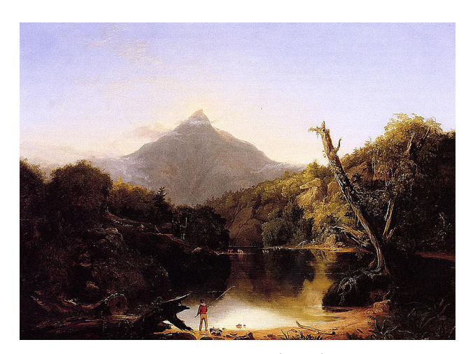
Mount Chocorua New Hampshire (1827)

In 1844, artist Frederic Church came to study under Cole. (Church's father paid Cole $300 a year (about $8000 in 2015 dollars) for training Church. Cole died in 1848 of pleurisy.