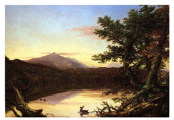
Schroon Lake (1838-40)

I will now speak of another component of scenery, without which every landscape is defective-it is water. Like the eye in the human countenance, it is a most expressive feature: in the unrippled lake, which mirrors all surrounding objects, we have the expression of tranquility and peace--in the rapid stream, the headlong cataract, that of turbulence and impetuosity.