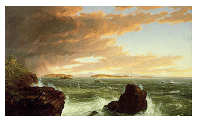
View Across Frenchman's Bay from Mount Desert Island After a Squall (1845)

What to them is the page of the poet where he describes or personifies the skies, the mountains, or the streams, if those objects themselves have never awakened observation or excited pleasure? What to them is the wild Salvator Rosa, or the aerial Claude Lorrain? There is in the human mind an almost inseparable connection between the beautiful and the good, so that if we contemplate the one the other seems present; and an excellent author has said, "it is difficult to look at any objects with pleasure--unless where it arises from brutal and tumultuous emotions--without feeling that disposition of mind which tends towards kindness and benevolence; and surely, whatever creates such a disposition, by increasing our pleasures and enjoyments, cannot be too much cultivated."